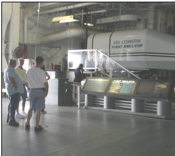
Tour of the USS Lexington