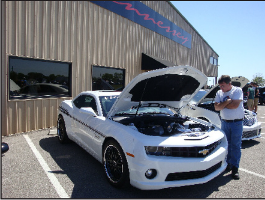
The next generation Camaro at Hennessey Motor Sports